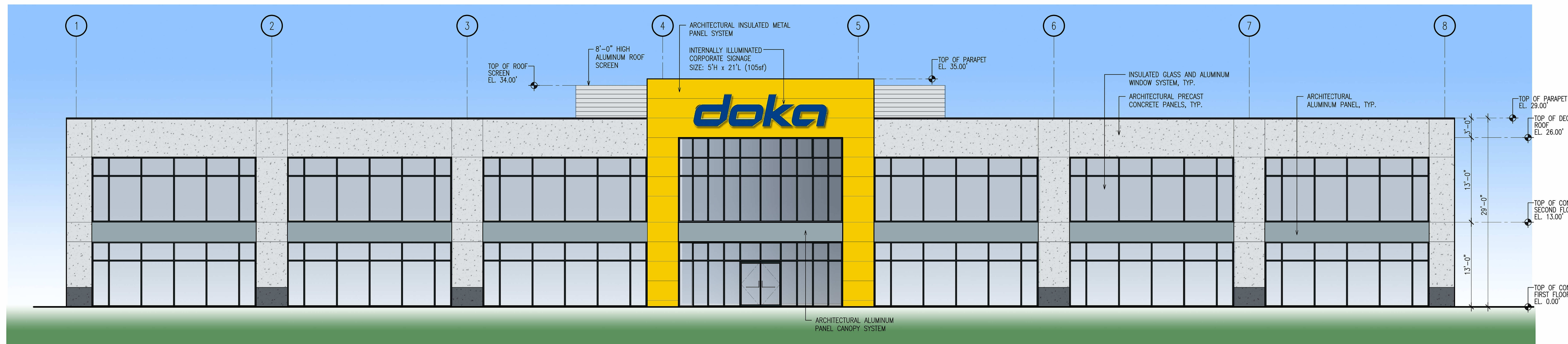
A PROPOSED WEST ELEVATION – OFFICE BUILDING SCALE: 1/8" = 1'-0"