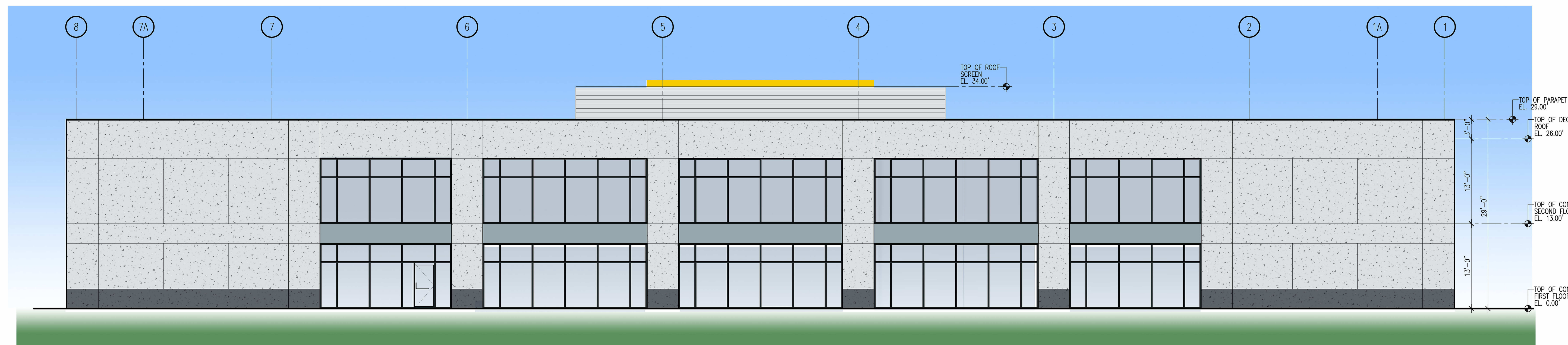
D PROPOSED EAST ELEVATION – OFFICE BUILDING SCALE: 1/8" = 1'-0" NOTE: REFER TO ELEVATION "A" FOR ADDITIONAL NOTES